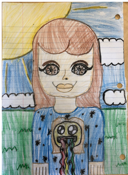
SELF-PORTRAIT BY 5TH GRADE STUDENT, LILYANA MARTINEZ HERNAN.

I am super excited to see the drawings you all created for our flag contest, and can't wait to select the two drawings (one representing middle school and one representing elementary school) that best reflect the spirit that Dragons are best known for and that I am lucky enough to witness in our community every day :) Let's GO, Dragons!